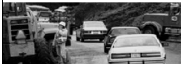
Former Bottom-halfer now enjoys life as Caltrans employee.